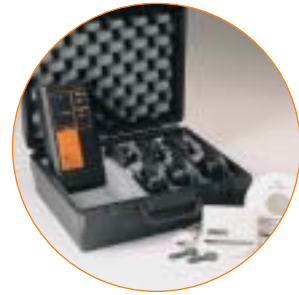
Specialty Construction Equipment